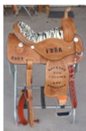
Stingray seat, fully tooled, floral

** fully tooled floral and basket weave – upgrade cost $100.00