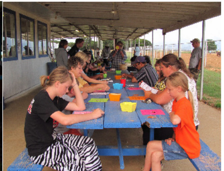
Some serious Bingo (Horse) Players

Region 2 would like to say ThankYou to all who participated in "Pass the Porcelain Throne". They were trying to raise money for Convention and did quite well.