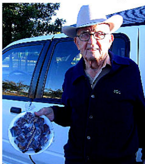
Delivering Brownies to the Concho Valley