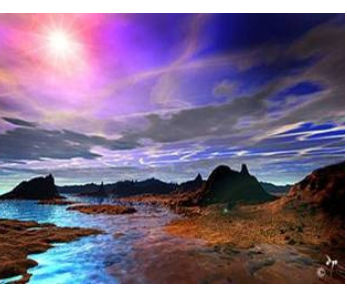
I Believe... That you shouldn't be so eager to find out a secret. It could change your life forever.