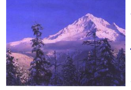
I Believe... That even when you think you have no more to give, When a friend cries out to you, you will find the strength to help.