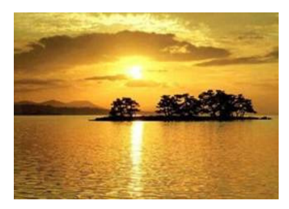
I Believe... That no matter how bad your heart is broken, the world doesn't stop for your grief.