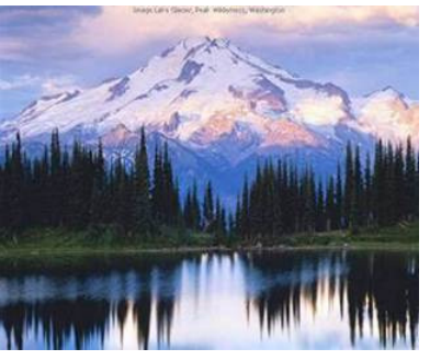
I Believe... That sometimes when I'm angry I have the right to be angry, but that doesn't give me the right to be cruel.