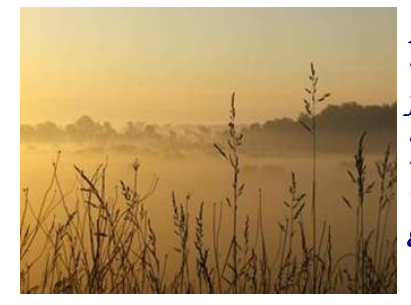
I Believe.... That sometimes the people you expect to kick you when you're down will be the ones to help you get back up.