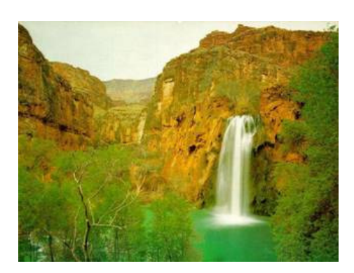
I Believe... That credentials on the wall do not make you a decent human being.