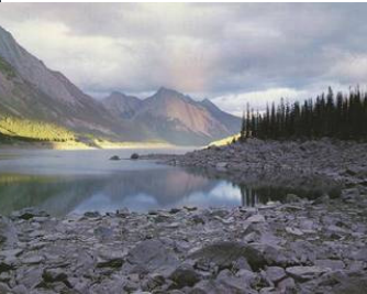
I Believe... That your life can be changed in a matter of hours by people who don't even know you.