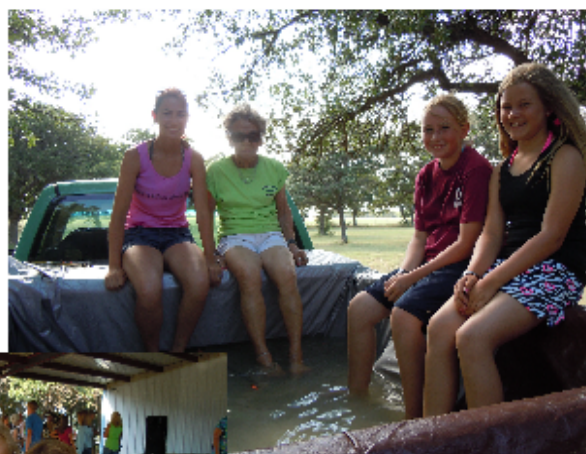
Pretty in Pink at Playday Finals 2010