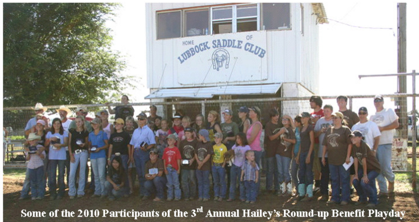
Some of the 2010 Participants of the 3 rd Annual Hailey's Round-up Benefit Playday